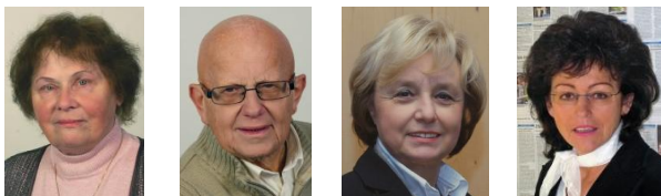
Seniors` management team

Seniors are awarded a “Seniors diploma” after successfully participating in eight semesters in a ceremony with the Rector of the Chemnitz University of Technology, guests of honor and the Scientific Director of Seniors College.