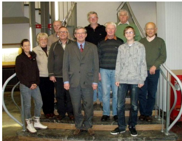
European Grundtvig – project group