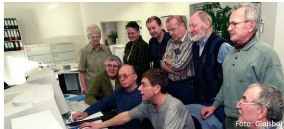
personal computer and internet course