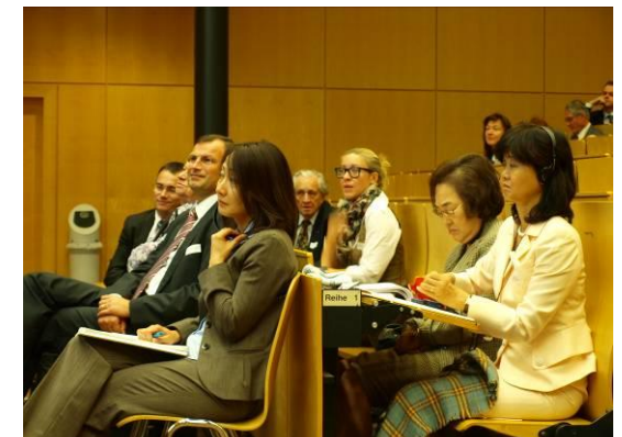
International Forum: Lifelong Learning 2011