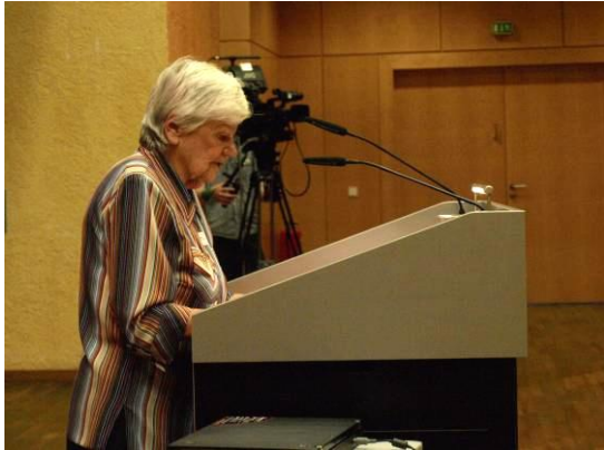
Speech of the oldest participant