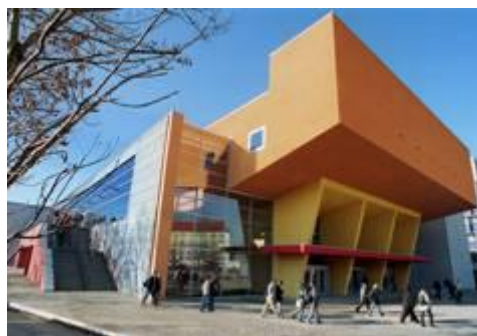
Central lecture building Reichenhainer Straße 90

Homepage: www.tu-chemnitz.de/seniorenkolleg