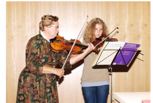
Cross-generational concert 2011